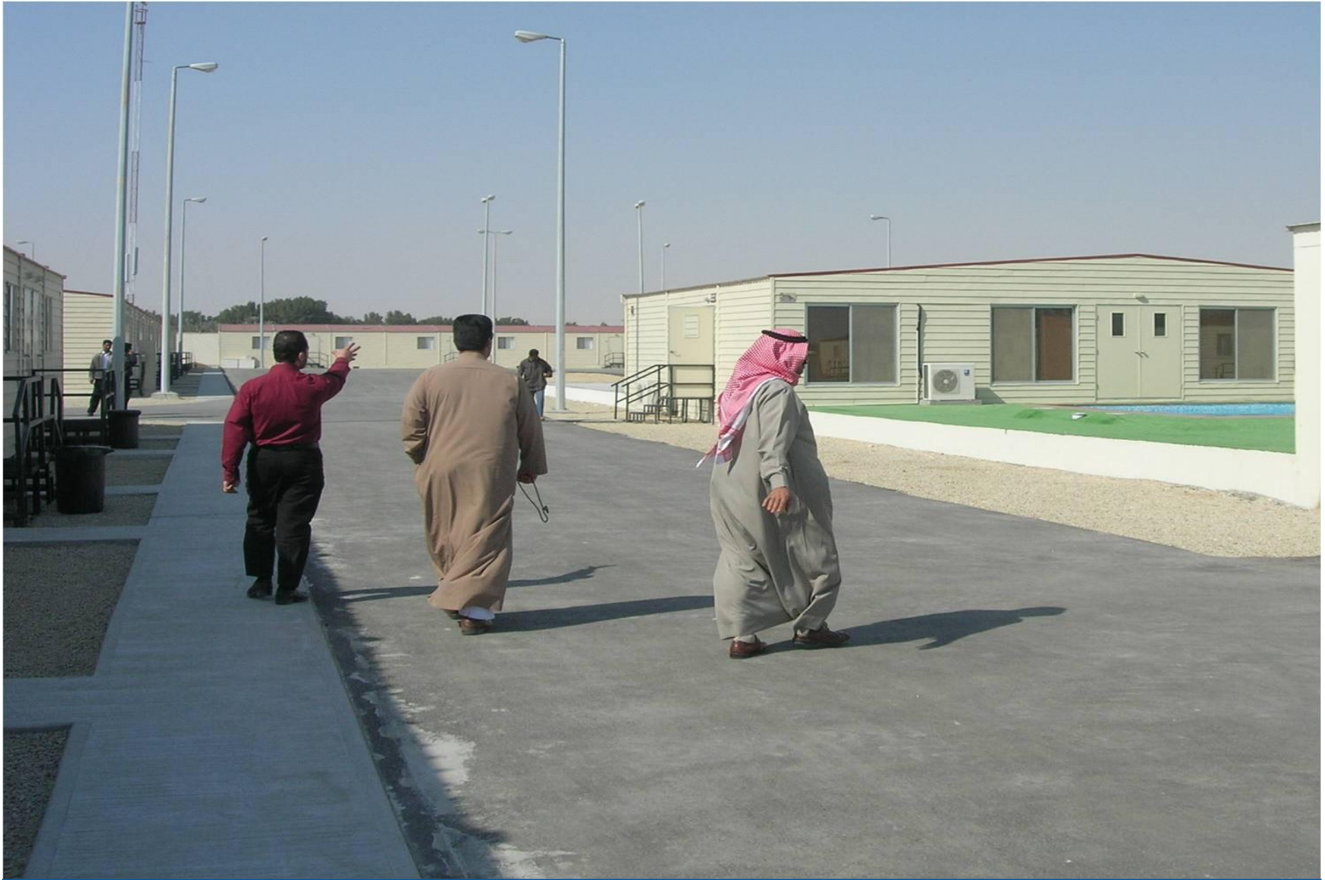
Paved Lighted Roads & Side walks