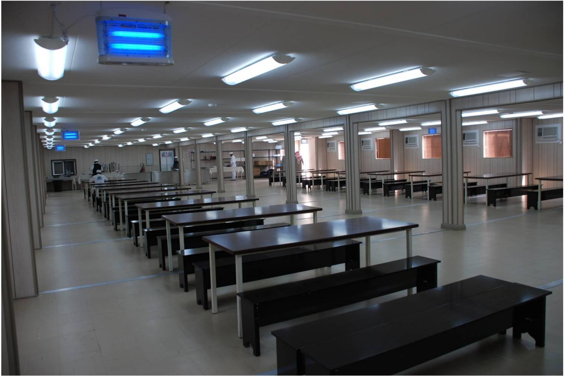
Dinning Hall (for Class “D”)