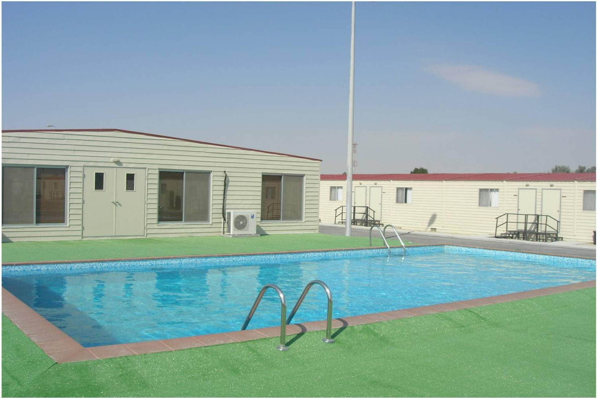
Swimming Pool (class "A")