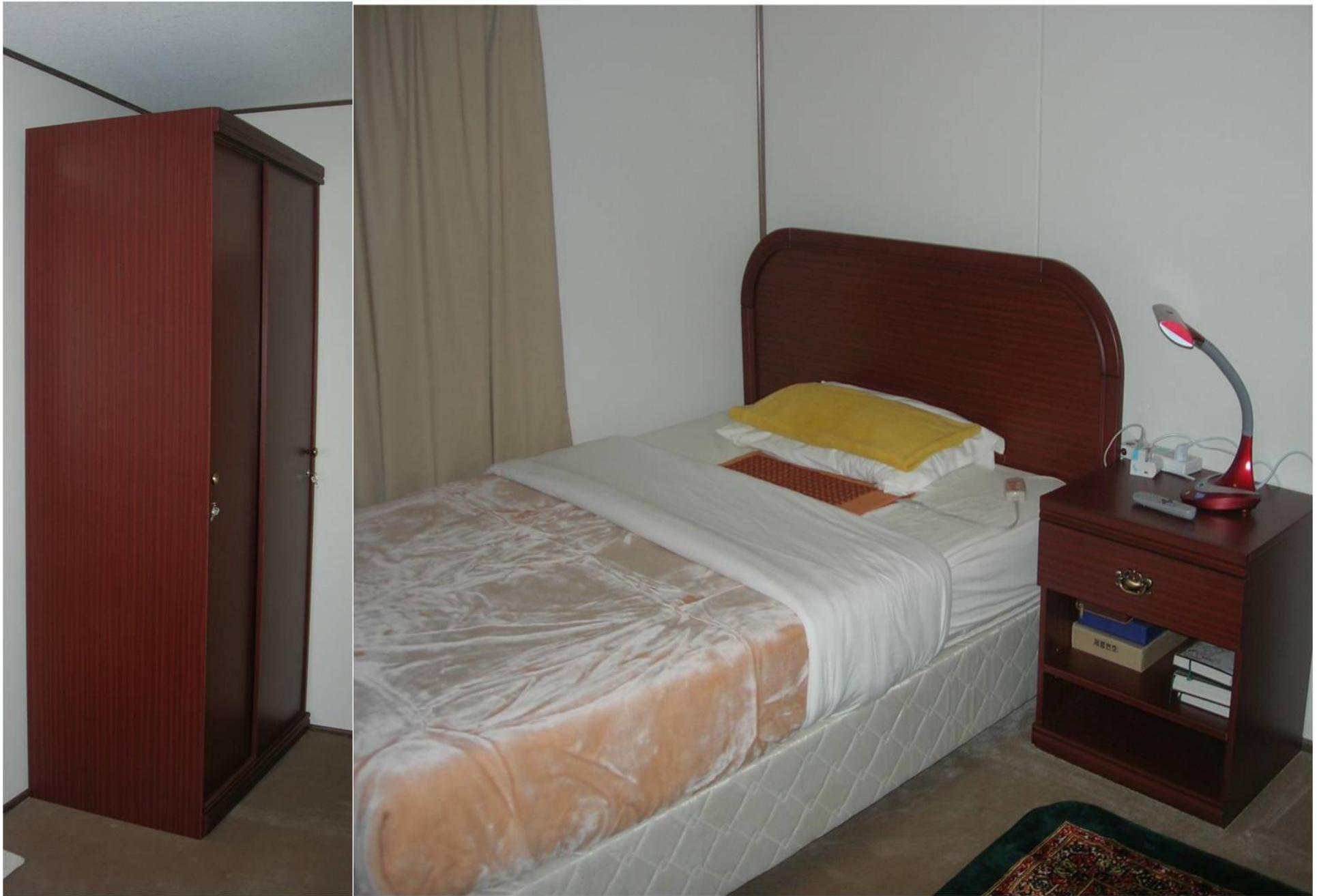
Bed Room & Bath Room