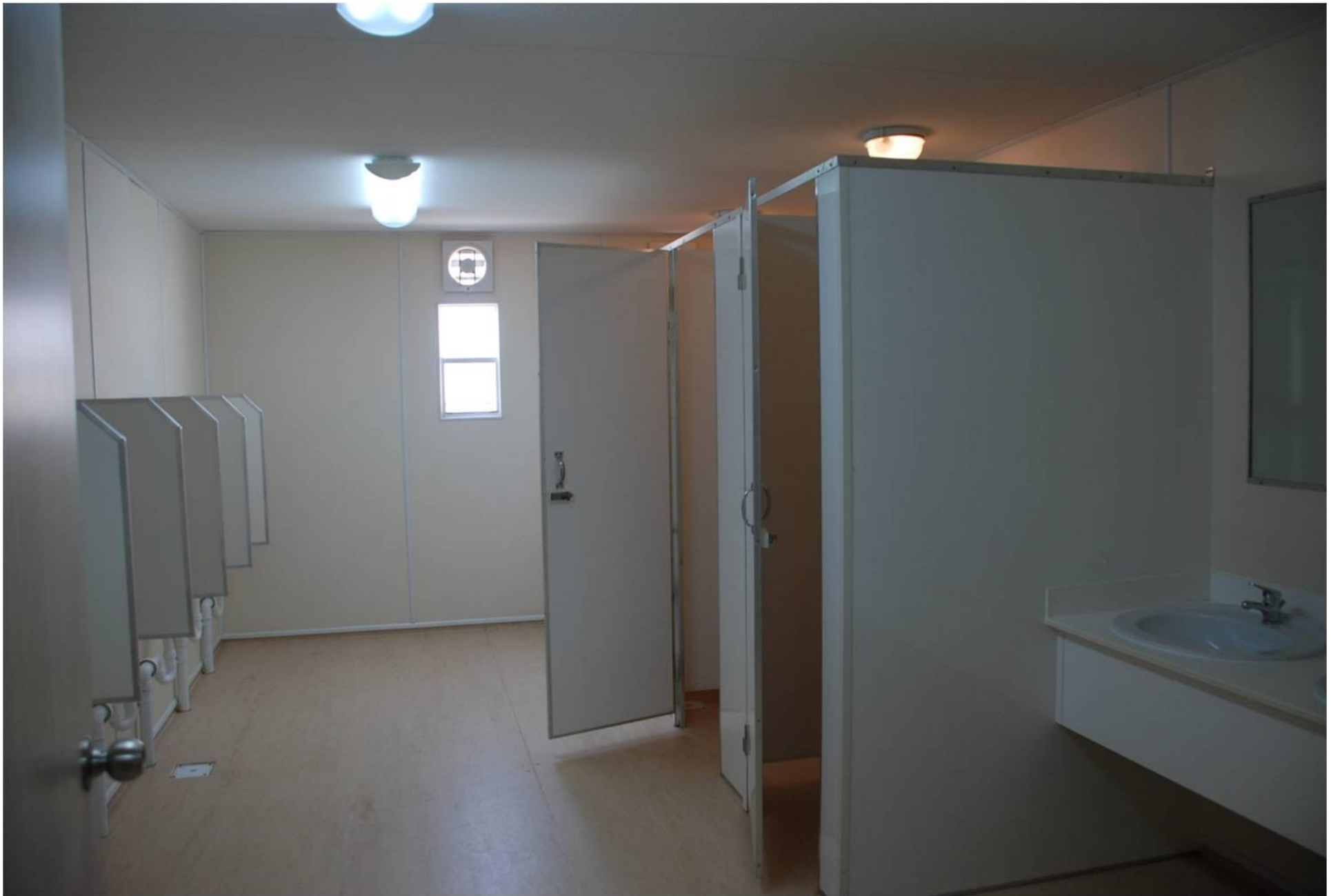
Toilets at Recreation Centre