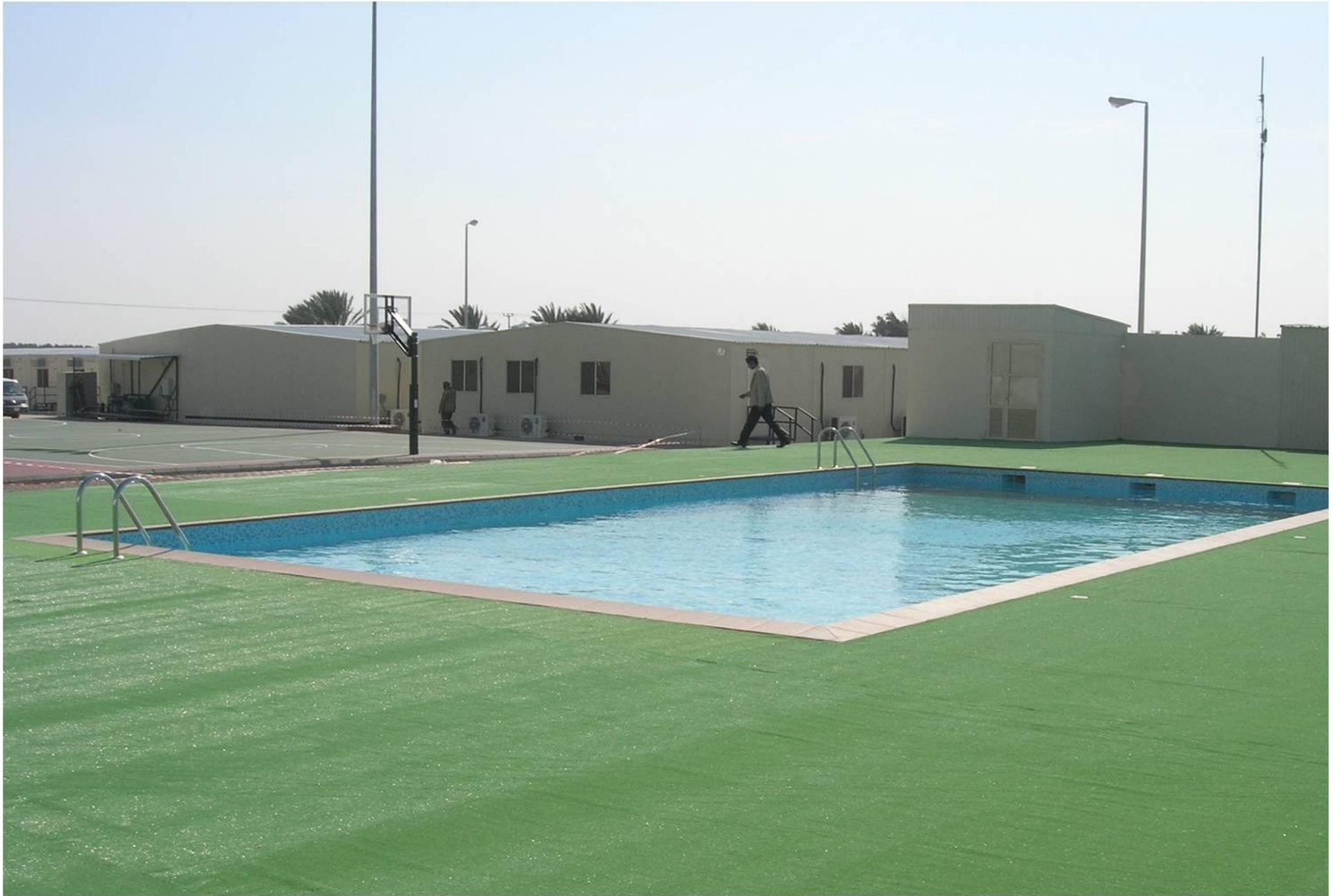
Swimming Pool (class “B&C”)