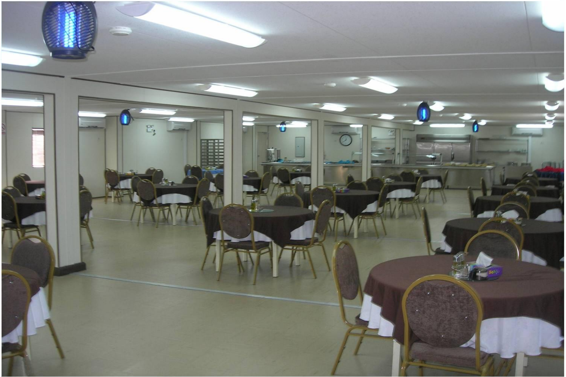
Dinning Hall (for Class “B” )