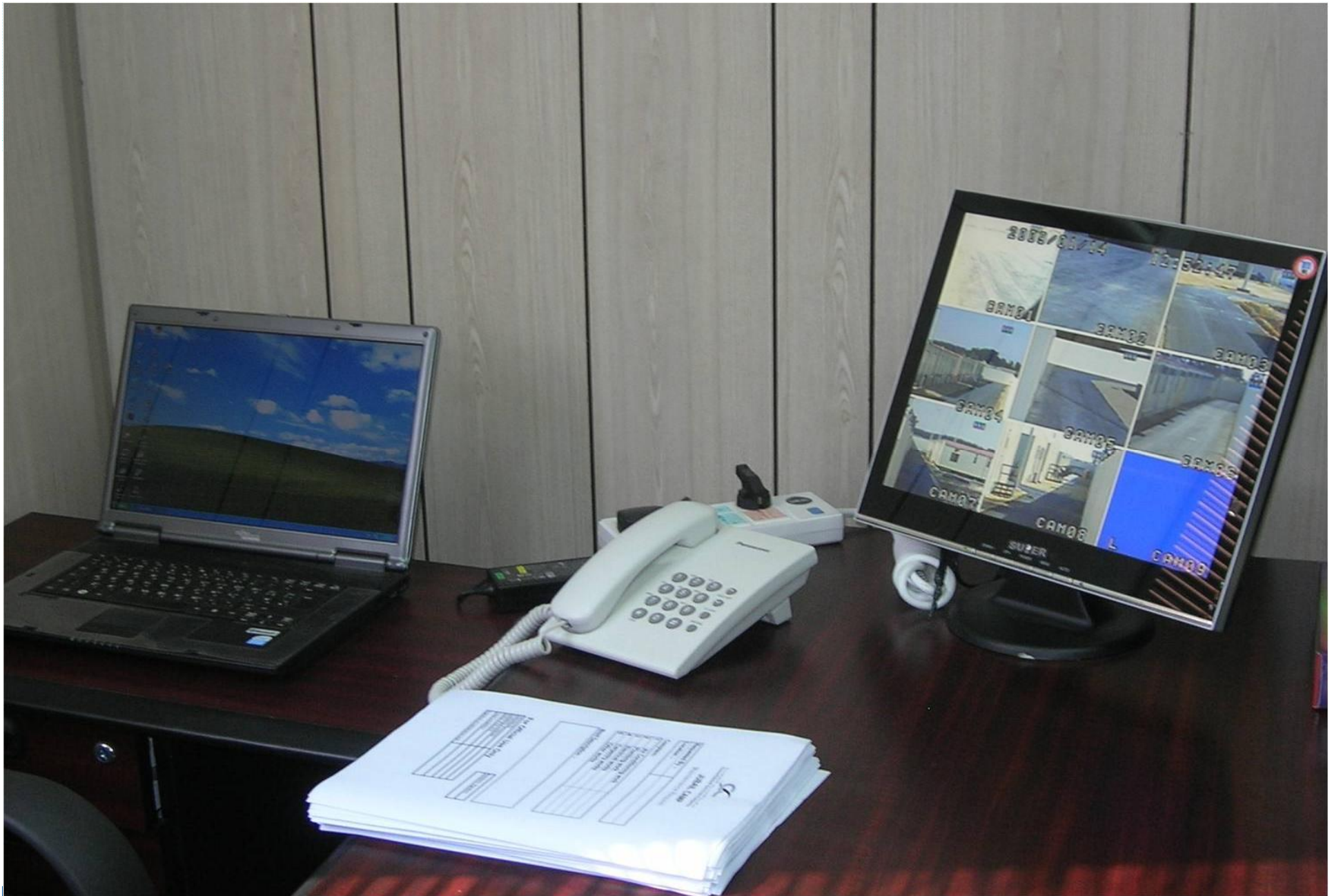
CCTV Security System