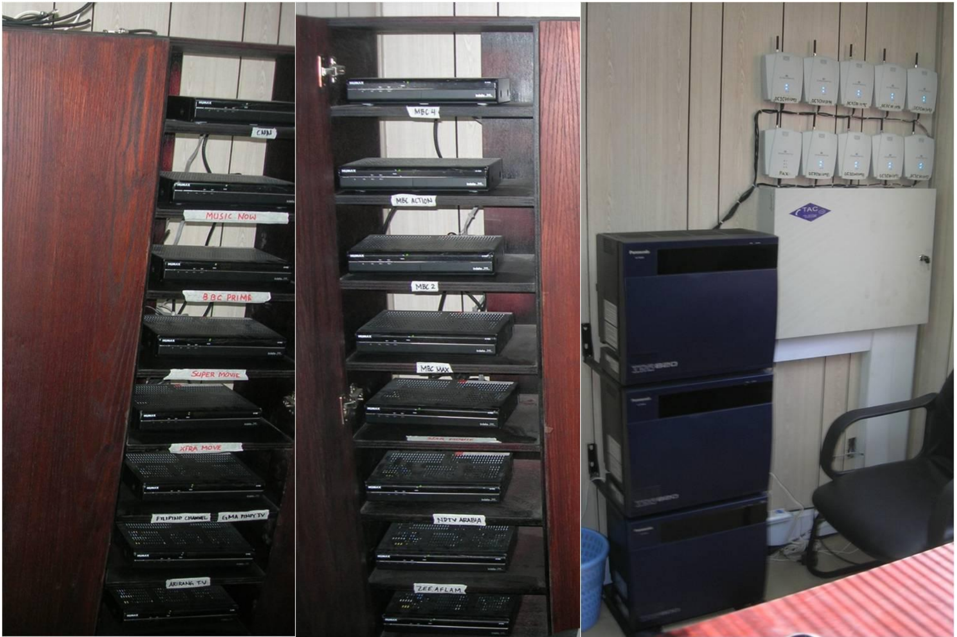
Control Room (TV, Tel & Security)