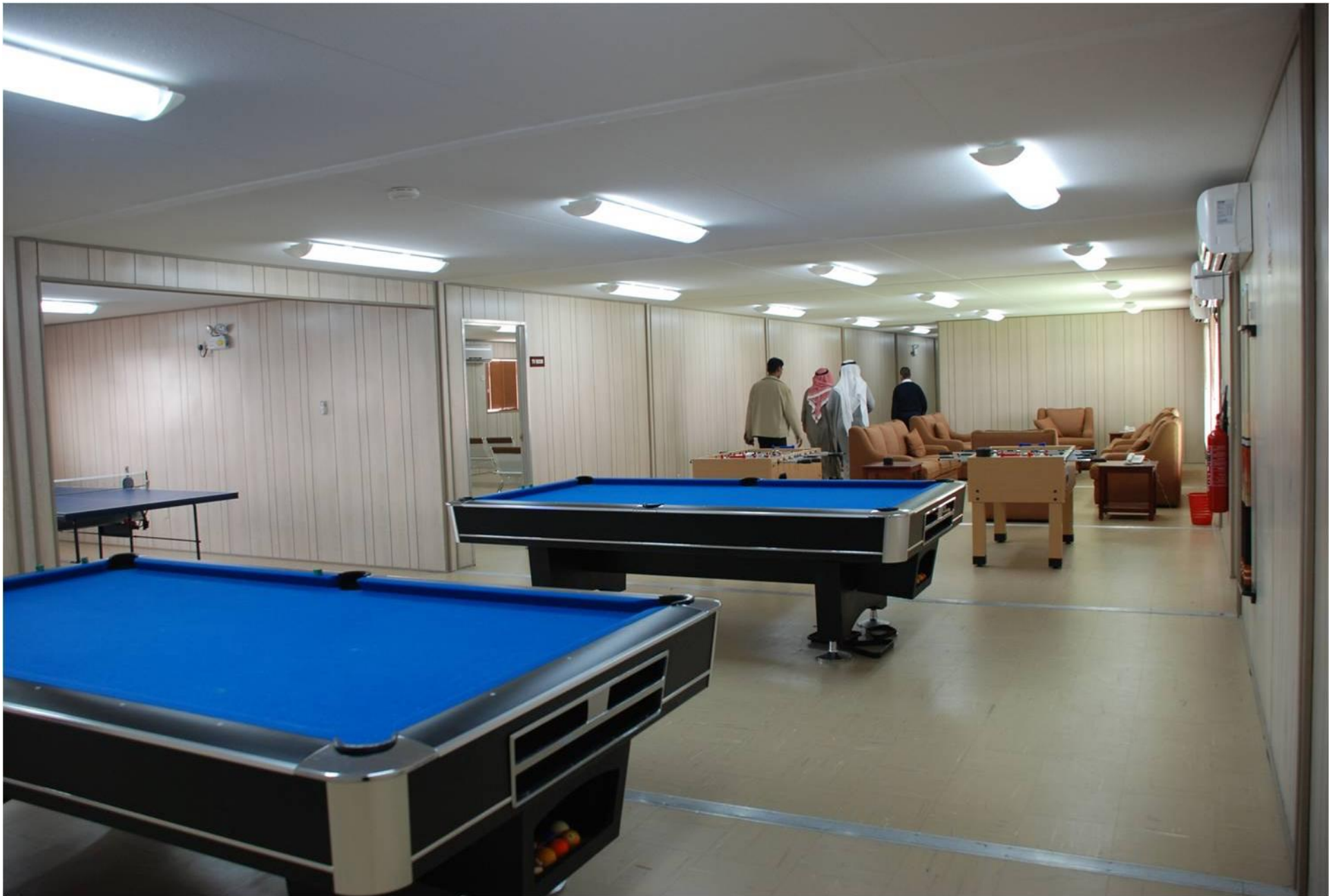
Recreation Center Class “A&B”