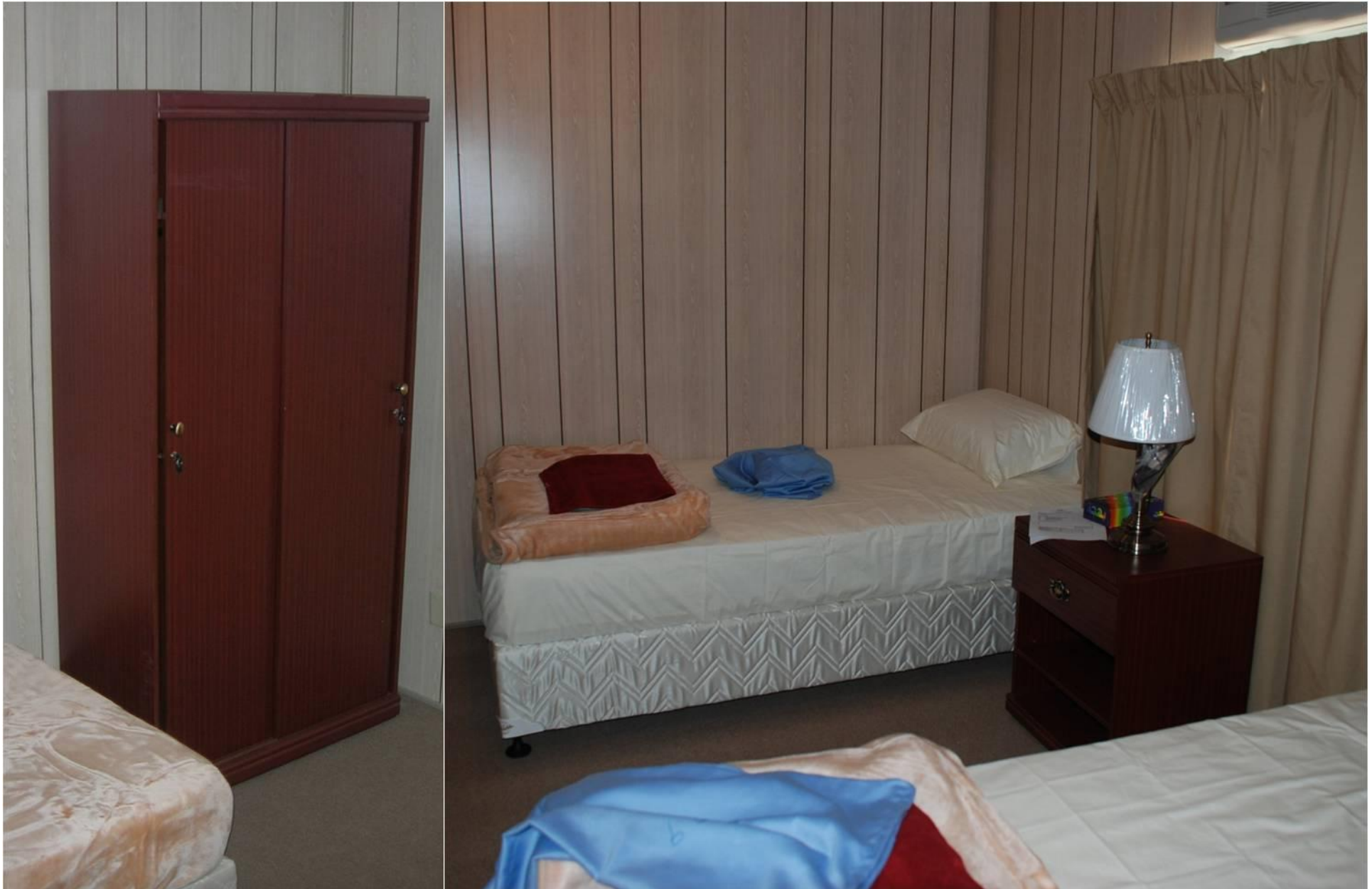
Bed Room & Bath Room