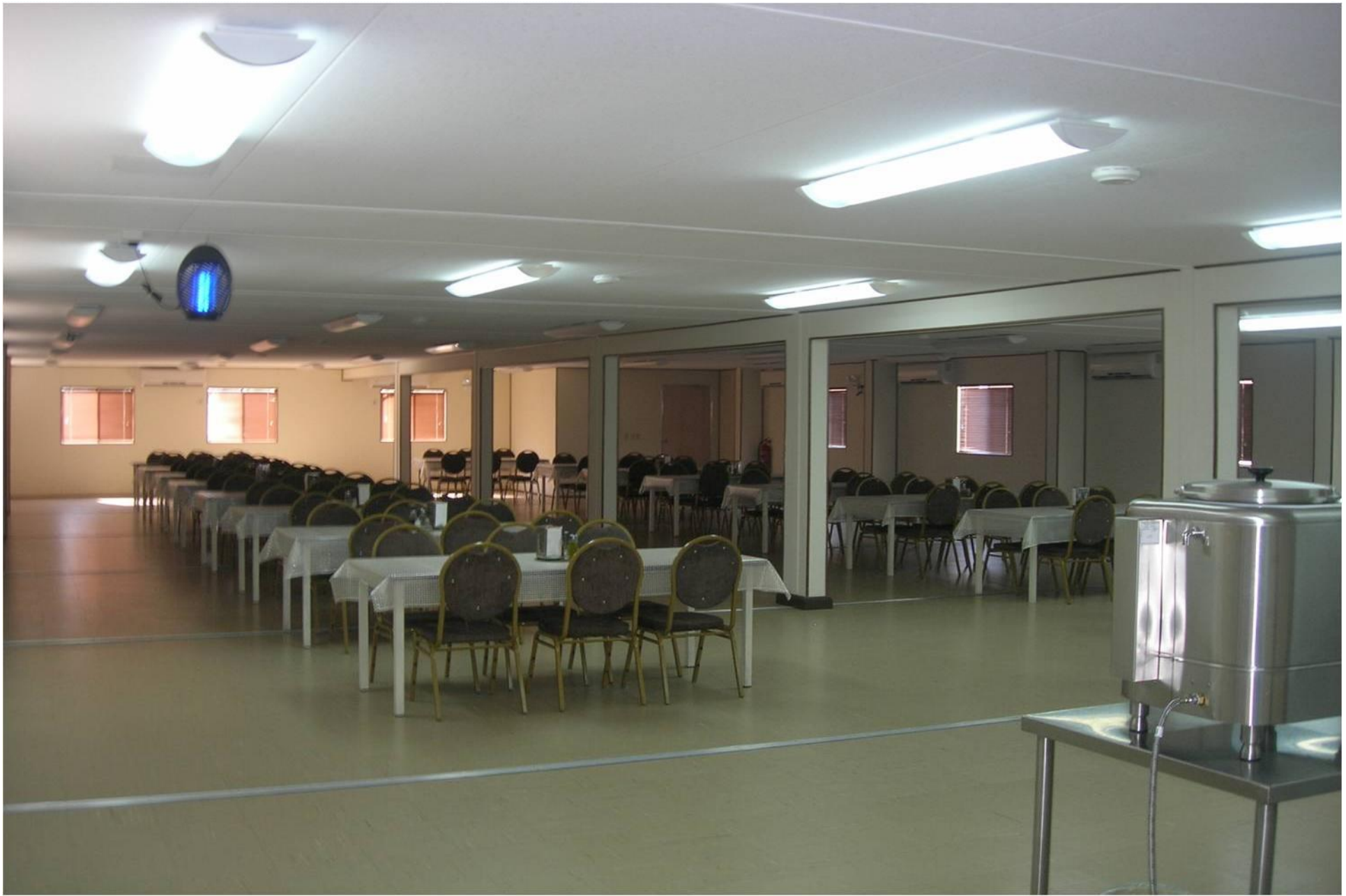
Dinning Hall (for Class “C”)