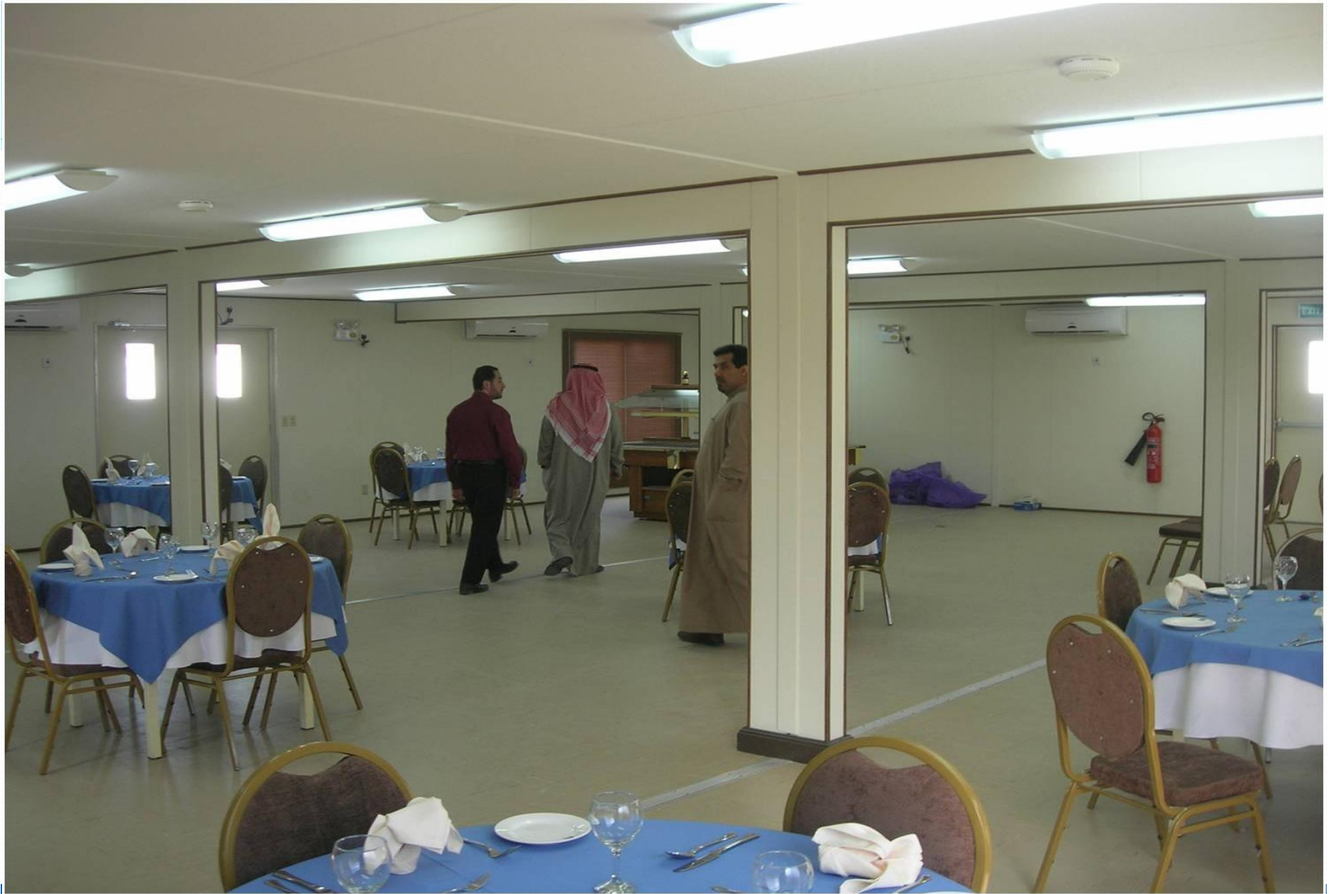
Dinning Hall (for Class “A” )